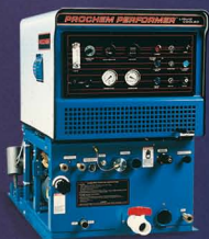
Performer Truck Mount