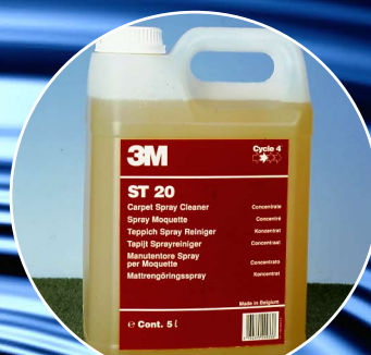
ST20 Carpet Spray Cleaner