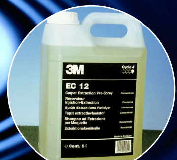
EC12 Extraction Pre-Spray Cleaner