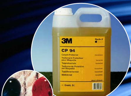
CP94 Carpet Protector available in 5 & 1 litre bottles