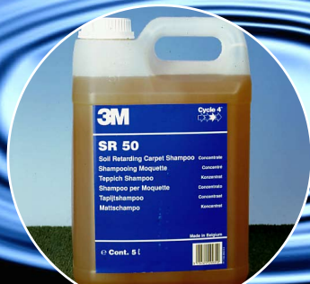
SR50 Soil Retarding Carpet Shampoo