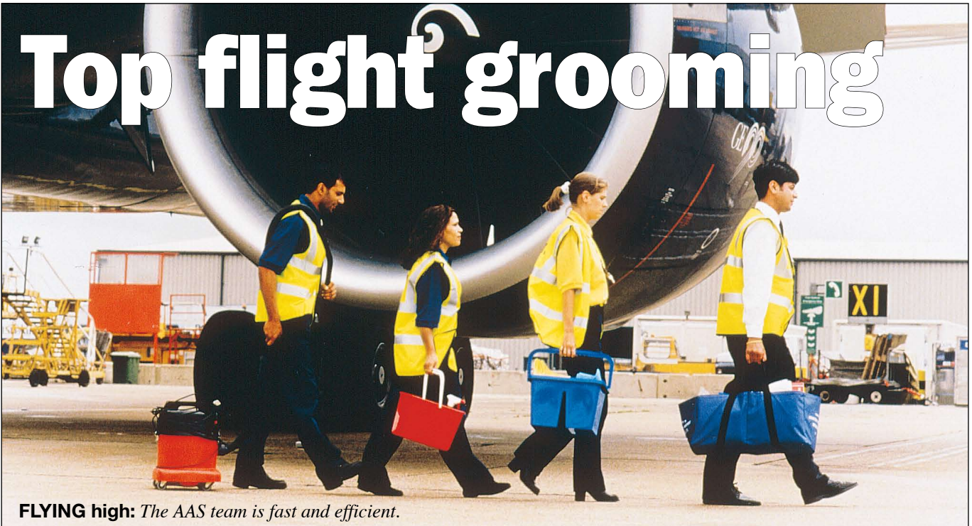
FLYING high: The AAS team is fast and efficient.

E FFICIENT service and rapid turnround are key facets to winning and securing business in the fastmoving world of air travel.